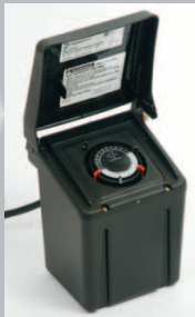
55400 - 121 Watt Timer-Transformer