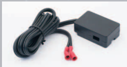
71527 - 60" Light Pigtail Connector