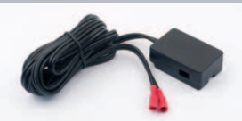
71528 - 96" Light Pigtail Connector