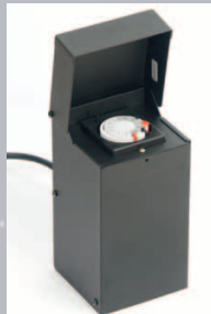
55401 - 300 Watt Timer-Transformer