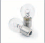
55388 - 18W Bulb for LV 4", 5" Base