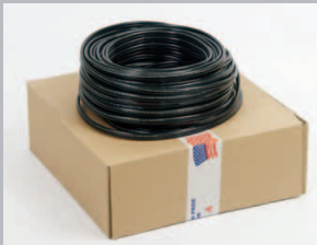
55398 - 100' Roll 12-2GA Black Wire HD LV