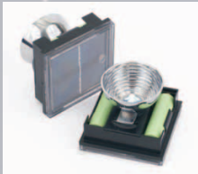
55389 - Solar Unit with Seal for Solar Top