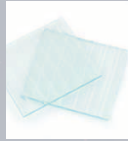
55382 - Glass Clear Ribbed for 2", 2-1/2" Base