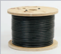
55399 - 500' Roll 12-2GA Black Wire HD LV