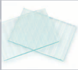
55383 - Glass Clear Ribbed for 4"/5" Base