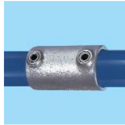
14 Straight Coupling