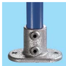
62 Standard Railing Flange