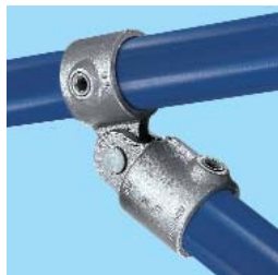
C50 Single Swivel Socket