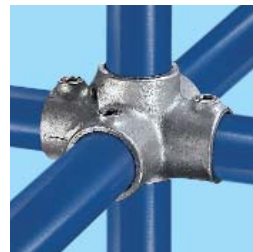
40 Four Socket Cross