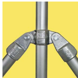
LC51 Double Swivel Socket