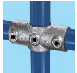
26 Two Socket Cross