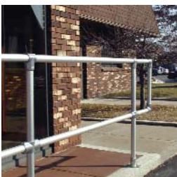
Indoor or Outdoor Use