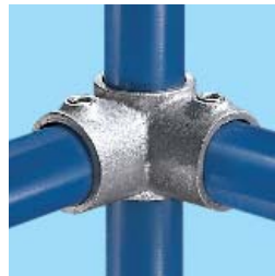
21 90° Side Outlet Tee