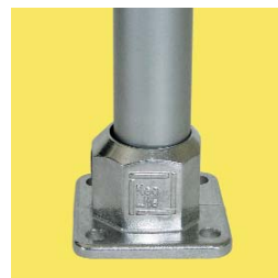
L152 Square Base Flange