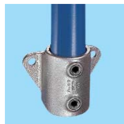
68 Wall Flange