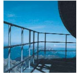
Rugged and Durable