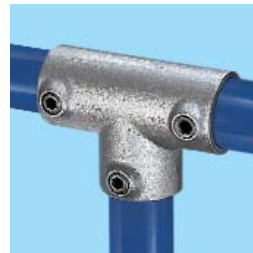
25 Three Socket Tee