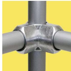
L21 90° Side Outlet Tee