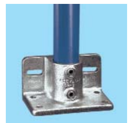
69 Flange/Toeboard Adapter

Kee Klamp fittings allow easy installation and provide a strong grip. The fittings have a wide application range including but not limited to handrails, safety barriers, guardrails, store fixtures, fences, awnings, bleachers, playground equipment, grid systems, and customer guidance. A standard hex key is used for assembly. Fittings have case hardened set screws with Kee Coat® II protective finish, are galvanized to ASTM A153, and are corrosion resistant with low long term maintenance. Designed to fit Schedule 40 pipe sizes 1/4" - 2". See the full line of Kee Klamp fittings on the Kee Klamp website, or request our 40 page catalog. • http://www.keeklamp.com •