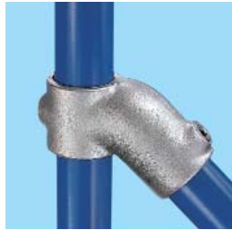
12 45° Single Socket Tee