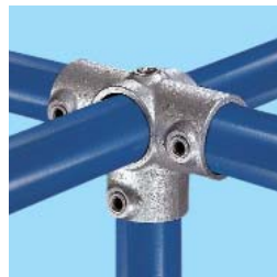
35 Three Socket Cross