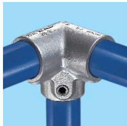
20 Side Outlet Elbow