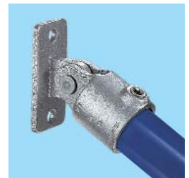
C58 Swivel Flange