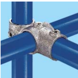
46 Socket Tee/Crossover