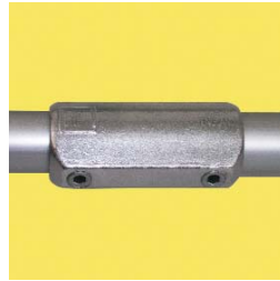
L14 Straight Coupling