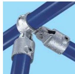
C52 Corner Swivel Socket