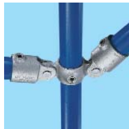
C51 Double Swivel Socket