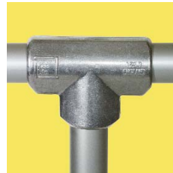
L25 Three Socket Tee