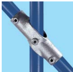
30 30° to 60° Adj. Cross