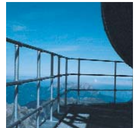
Rugged and Durable