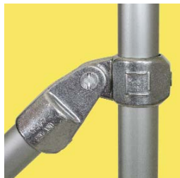
LC50 Single Swivel Socket