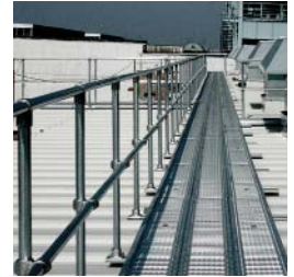
Easy System Integration