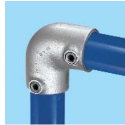
15 90° Elbow