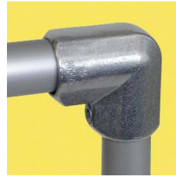
L15 90° Elbow