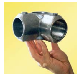
Full Catalog Available

High grade aluminum silicon magnesium alloy withstands corrosive environments. Lightweight yet durable, Kee Lite aluminum fittings have a wide range of use in various environments including water treatment facilities, industrial plant safety, retail spaces, interiors, recreation, and theatrical and entertainment. Designed for use with Schedule 40 pipe sizes 1" - 2".