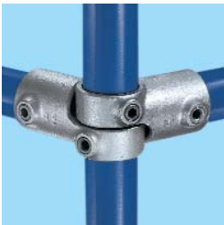
19 Adj. Side Outlet Tee