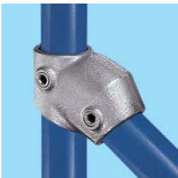
29 30° to 60° Socket Tee