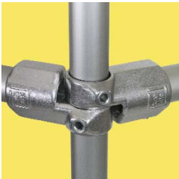
L19 Adj. Side Outlet Tee