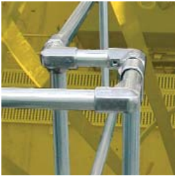
Lightweight and Versatile

Lightweight Yet Durable With An Esthetic Look and Design A Wide Variety of Uses Including Industrial and Commercial, Retail and Restaurant, Municipal, Institutional, and Entertainment