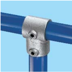
10 Single Socket Tee