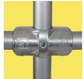
L26 Two Socket Cross