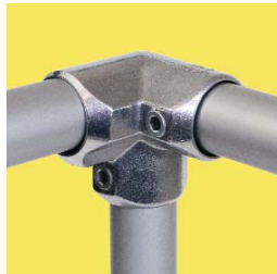
L20 Side Outlet Elbow