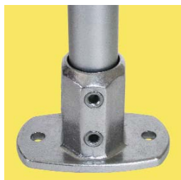
L62 Standard Railing Flange