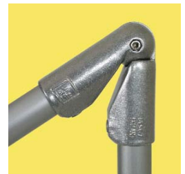
LB54 45°-200° Swivel Elbow