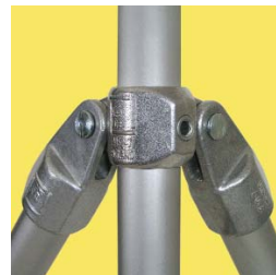
LC52 Corner Swivel Socket