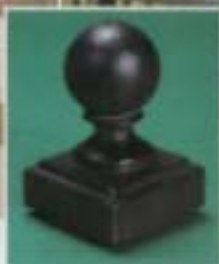
Our post tops are made to weather the elements.