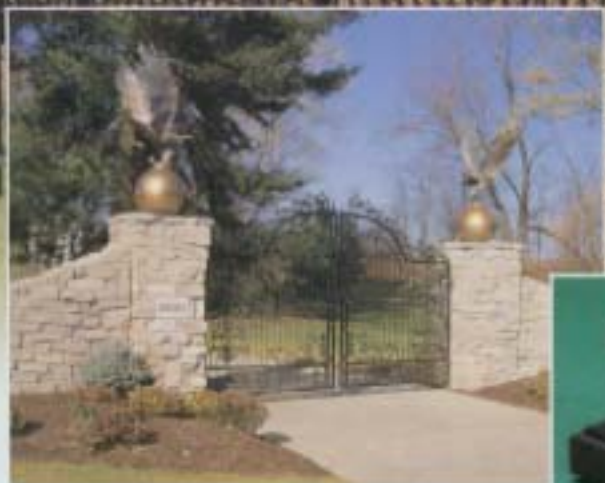
Our classically-designed gates complement any landscape.