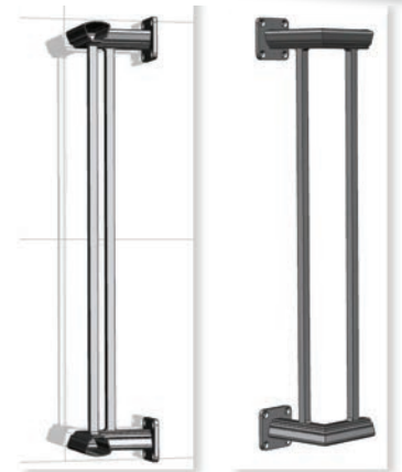
3/4 inside View