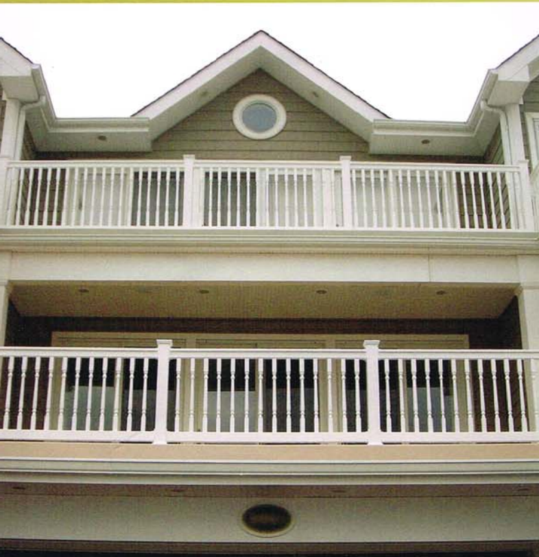
System testing data available.