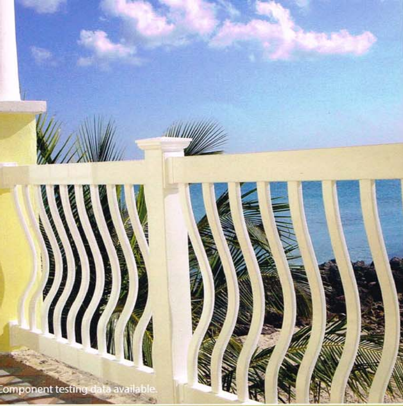
Component testing data available.