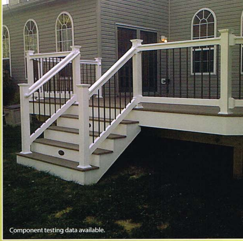
Component testing data available.