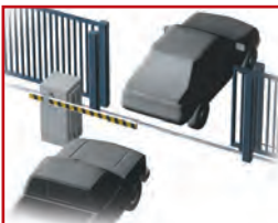
automatic p.a.m.s. sequencing with slide and swing gates