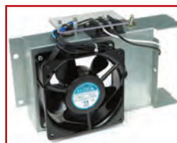
fan/heater kits options available for extreme weather