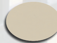
Gloss Beige DSI 104