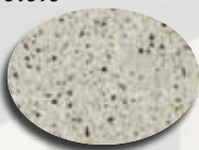
Sandy Shore DSI 122