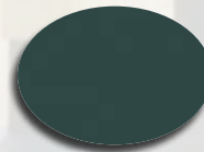
Evergreen DSI 111