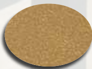
Gold Accent DSI 110

§ Lifetime Limited Warranty for end users. 30-Year for Government, Municipalities and Corporations.