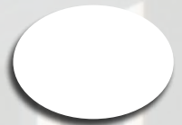
Gloss White DSI 102