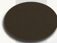
Metallic Bronze DSI 103