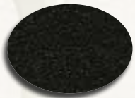
Black Fine Texture DSI 106