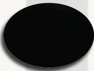
Satin Black DSI 101